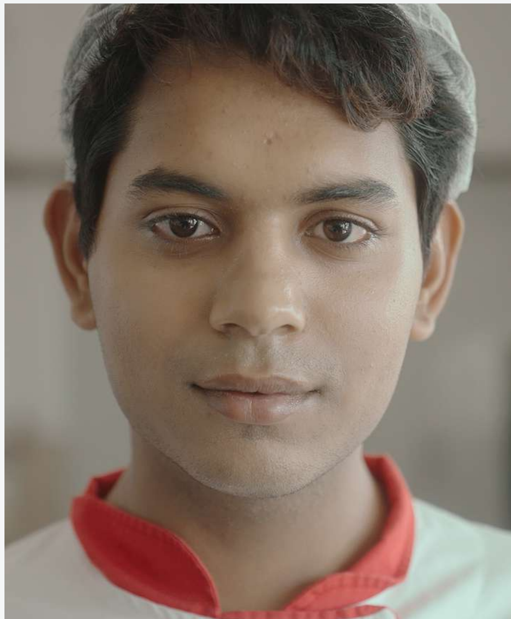
I am Nicu